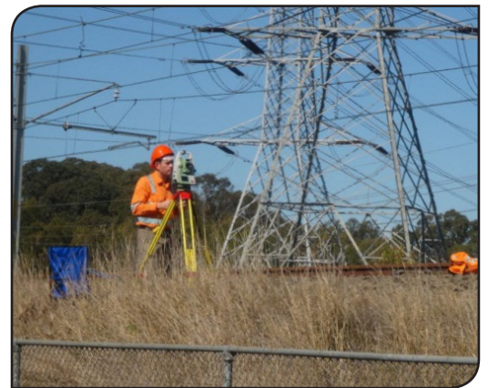
+ Track Protection Officer was vigilant and checking track condition at regular interval during micro tunnelling operation

Pezzimenti tunnelbore received praise from both the client and Endeavour Energy who were quite nervous about the work being completed in time.