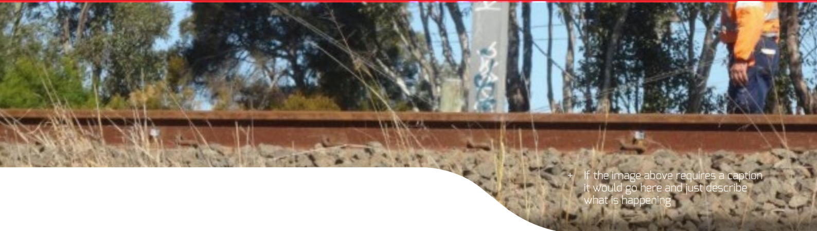
+ If the image above requires a caption it would go here and just describe what is happening