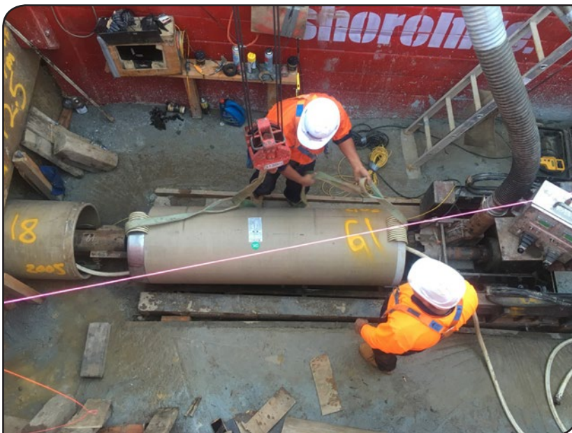
+ Pipejacking the GRP Pipes