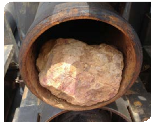
+ Large cobbles encountered.

The 180m microtunnel encountered very hard cobbles at the 94m mark and slowed progress until the 120m mark when progress was halted after encountering a 120mm cobble. Because Pezzimenti carry multiple drilling rigs and MTBM's the microtunnel was completed using the intercept method drilling from the upstream end. Excavation of the surface in the Aboriginal sensitive area was not an option.